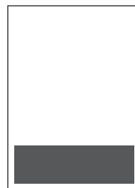
Quarter Page H