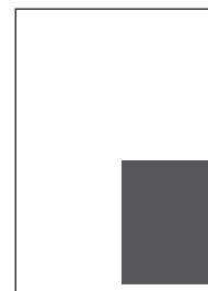
Quarter Page V

For more information about advertising contact Cindy Suffa - 208.639.3517, csuffa@idahobusinessreview.com